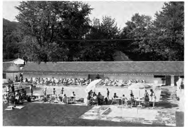
Outdoor pool area at the Equinox, scene of many hours of enjoyment during Alpha Phi Delta's 40th National Convention.

As an innovation, the Convention activities committee also presented a door prize as the beginning of each business session to the winner among those who came