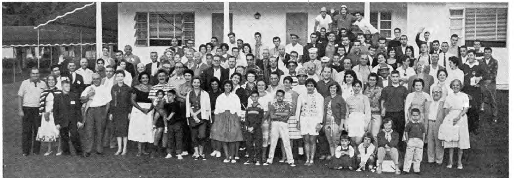
Below: A portion of the large group of Alpha Phi Delta delegates, Brothers and their families who attended the 40th National Convention held at the Equinox House, Manchester, Vermont.