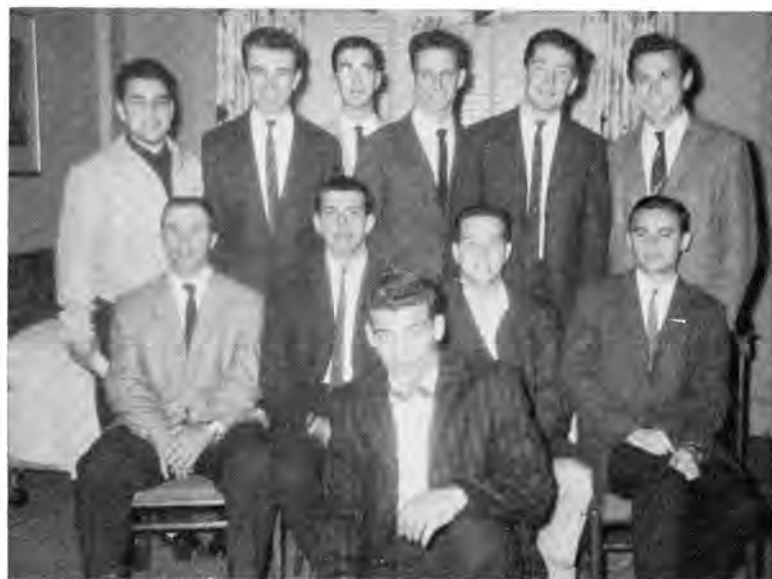
Above: Newly initiated Brothers of Sigma Chapter who have boosted the prospects of the chapter the past year. Below: Charter members of Sigma Chapter at their Installation Dinner, February, 1927.